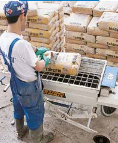
Mixing Topcem in a mini-batcher