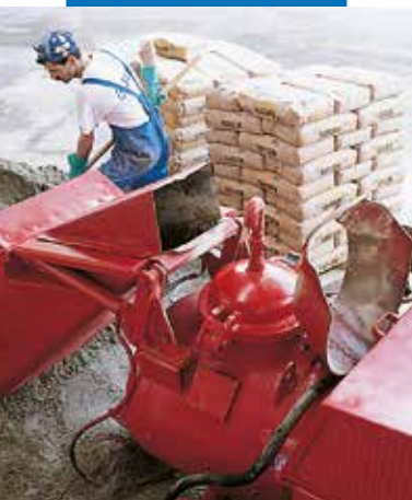
Mixing Topcem with an automatic pumping unit