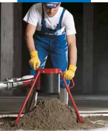
Batching a Topcem mix